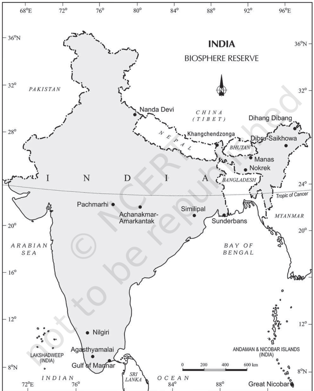
Figure 5.9 : India : Biosphere Reserves