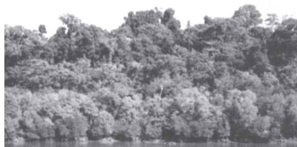
Figure 5.1 : Evergreen Forest

The semi evergreen forests are found in the less rainy parts of these regions. Such forests have a mixture of evergreen and moist deciduous trees. The undergrowing climbers provide an evergreen character to these forests. Main species are white cedar, hollock and kail.