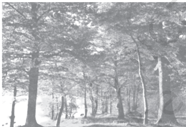
Figure 5.3 : Deciduous Forests

These are the most widespread forests in India. They are also called the monsoon forests. They spread over regions which receive rainfall between 70-200 cm. On the basis of the availability of water, these forests are further divided into moist and dry deciduous.