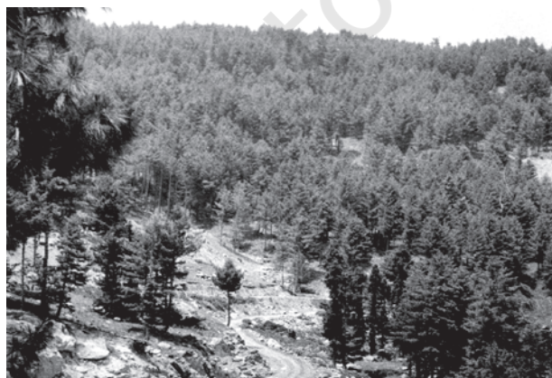
Figure 5.5 : Montane Forests

The Himalayan ranges show a succession of vegetation from the tropical to the tundra, which change in with the altitude. Deciduous forests are found in the foothills of the Himalayas. It is succeeded by the wet temperate type of forests between an altitude of 1,000-2,000 m. In the higher hill ranges of northeastern India, hilly areas of West Bengal and Uttaranchal, evergreen broad leaf trees such as oak and chestnut are predominant. Between 1,500-1,750 m, pine forests are also well-developed in this zone, with Chir Pine as a very useful commercial tree. Deodar, a highly valued endemic species grows mainly in the western part of the Himalayan range. Deodar is a durable wood mainly used in construction activity. Similarly, the chinar and the walnut, which sustain the famous Kashmir handicrafts, belong to this zone. Blue pine and spruce appear at altitudes of 2,225-3,048 m. At many places in this zone, temperate grasslands are also found. But in the higher reaches there is a transition to Alpine forests and pastures. Silver firs, junipers, pines, birch and rhododendrons, etc. occur between 3,000-4,000 m. However, these pastures are used extensively for transhumance by tribes like the Gujjars, the Bakarwals, the Bhotiyas and the Gaddis. The southern slopes of the Himalayas carry a thicker vegetation cover because of relatively higher precipitation than the drier north-facing slopes. At higher altitudes, mosses and lichens form part of the tundra vegetation.