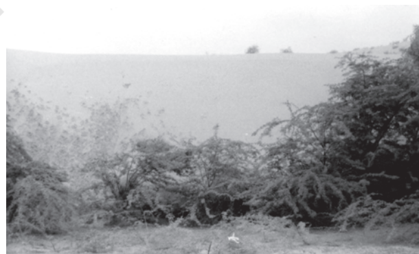
Figure 5.4 : Tropical Thorn Forests

Tropical thorn forests occur in the areas which receive rainfall less than 50 cm. These consist of a variety of grasses and shrubs. It includes semi-arid areas of south west Punjab, Haryana, Rajasthan, Gujarat, Madhya Pradesh and Uttar Pradesh. In these forests, plants remain leafless for most part of the year and give an expression of scrub vegetation. Important species found are babool , ber , and wild date palm, khair , neem , khejri , palas , etc. Tussocky grass grows upto a height of 2 m as the under growth.