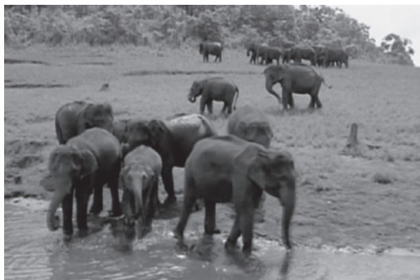
Figure 5.7 : Elephants in their Natural Habitat